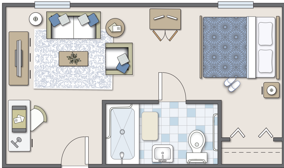
Double Suite | 419 SF