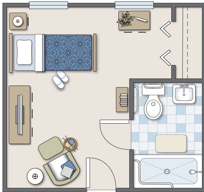
Studio Suite | 255 SF

Small square footage is an approximation of our best efforts to accurately represent interior spaces, including bathrooms and closets, and may vary slightly from the actual size.